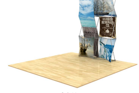
Aerial view of 10' x 10' space