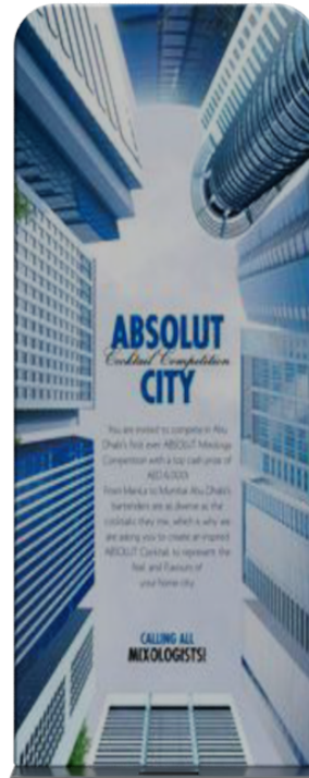
Shown with base plate