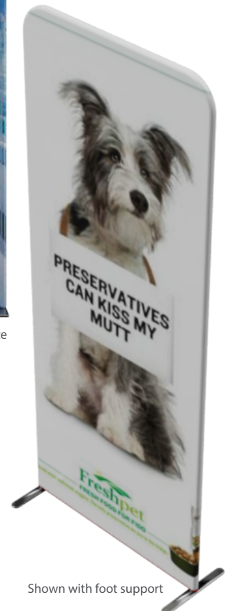
Shown with foot support